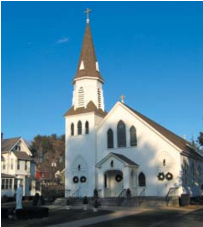
St. Joseph, Chester, Connecticut